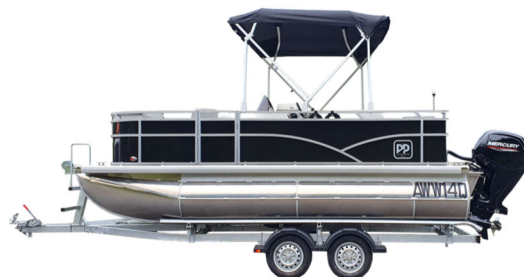
16ft 60hp Superior In-Shore Boat & Trailer