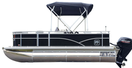
16ft 60hp Superior In-Shore Boat (no Trailer)