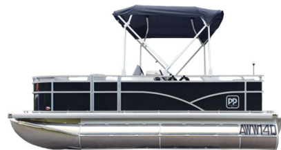
16ft Superior In-Shore Boat only (no Trailer & no Motor)