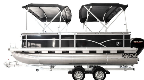
19ft 60hp Luxury In-Shore Boat & Trailer