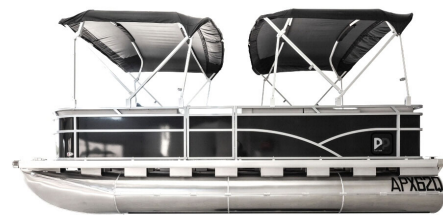
19ft Luxury In-Shore Boat only (no Trailer & no Motor)