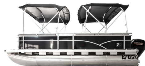
19ft 60hp Luxury In-Shore Boat (no Trailer)